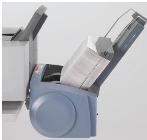
OptiFlow™ Vertical Power Stacker