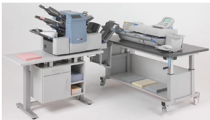
The SI3300 in combination with the DM550 mailing system provides an ideal solution.

Each configuration is available with Optical Mark Recognition.